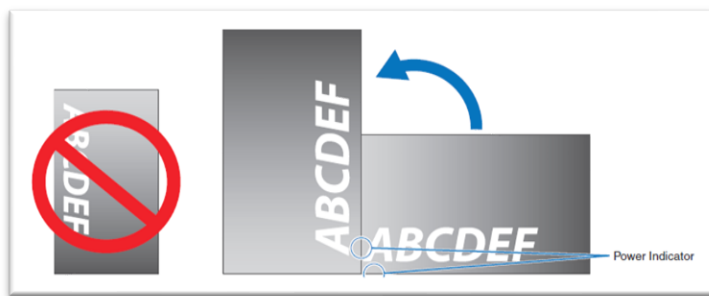
Example 1: counterclockwise

LCD displays are designed and manufactured for a standard use in vertical position. Some models can be used only in landscape and others also in portrait orientation. Please refer to product's user manual to find the correct rotation direction!