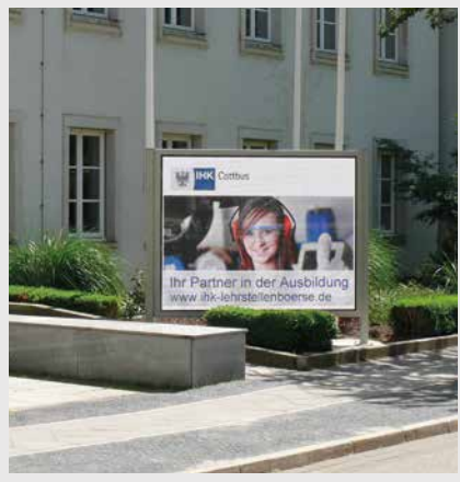
IHK, Cottbus / Germany