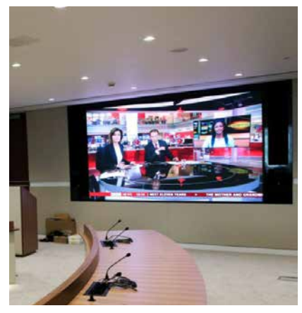
Santander Bank, London / Great Britain