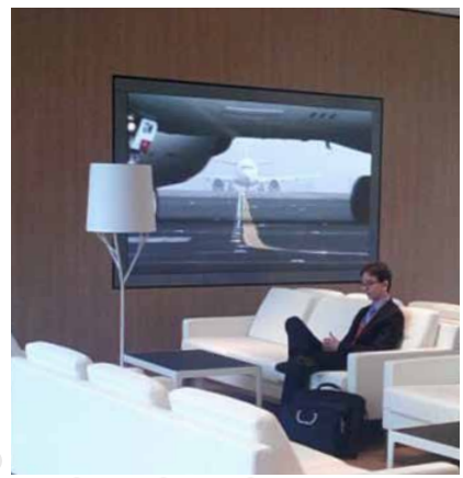
Thales, Bordeaux and Paris / France