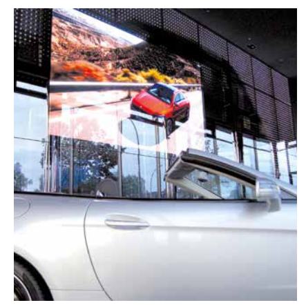
Mercedes-Benz, Berlin / Germany