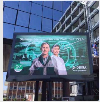
DEKRA, Stuttgart / Germany