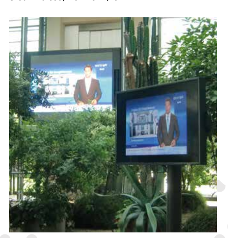
Max-Planck-Institut, Dresden / Germany