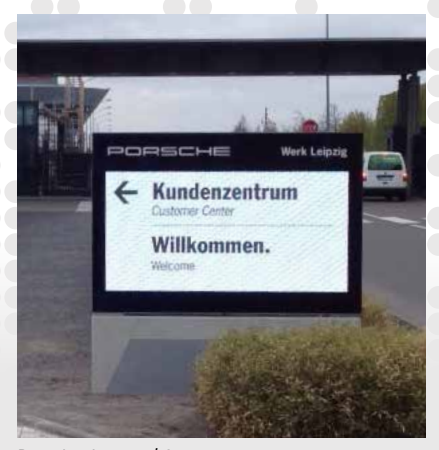
Porsche, Leipzig / Germany