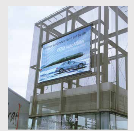
Mercedes-Benz, Friedrichshafen / Germany