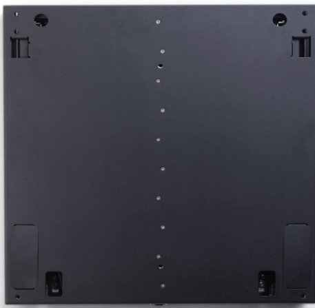
NEC MultiSync® C754Q mounted on BalanceBox® 400 HEAVY

Adjust the height of your display with the lightest of touches, and no electrical connection needed! The trend in today's audio visual market is interactivity; touchscreen displays in class rooms, trainings centres, video conferencing rooms and on the production floor. To allow every participant to enjoy the benefits of the interactive system, the BalanceBox® is an innovative height adjustable mount solution based on a unique technology with great features.