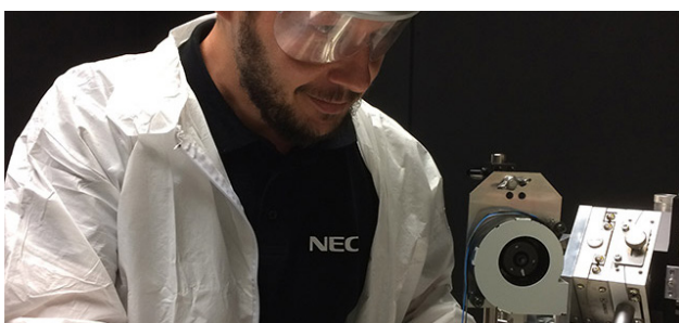
The Sharp/NEC Prism Refurbishment Program extends the lifecycle of digital cinema projectors

You can find details of our wide range of added value services on our website under 'Support'. If a product or solution is irreparably defective, we recycle it in accordance with the statutory regulations.